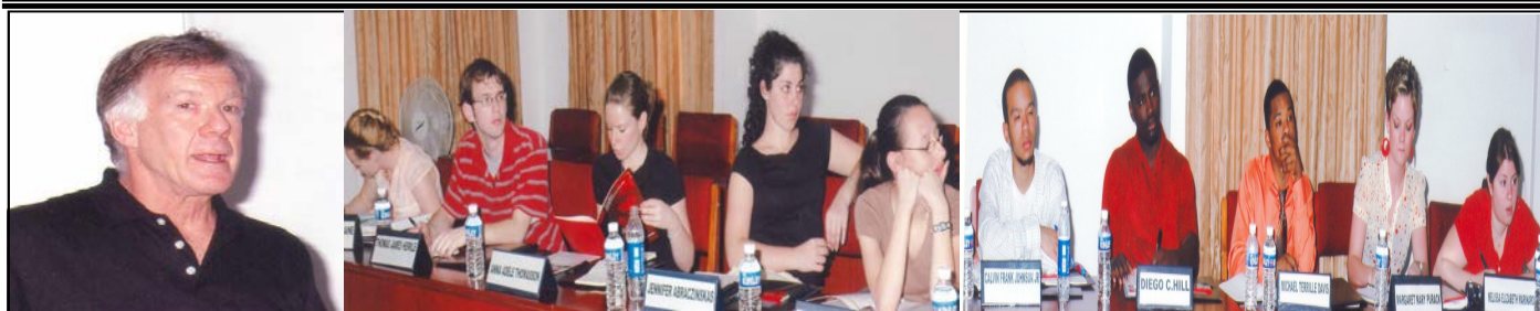
The La Salle Team