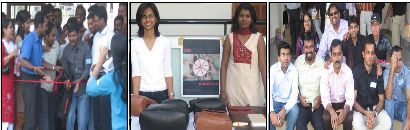
XIME family share a light moment together

All in all, as the day came to a close, alumni and students alike were left asking for more. What they ask will be delivered to them of course, in XIME Alumni Meet 2008!