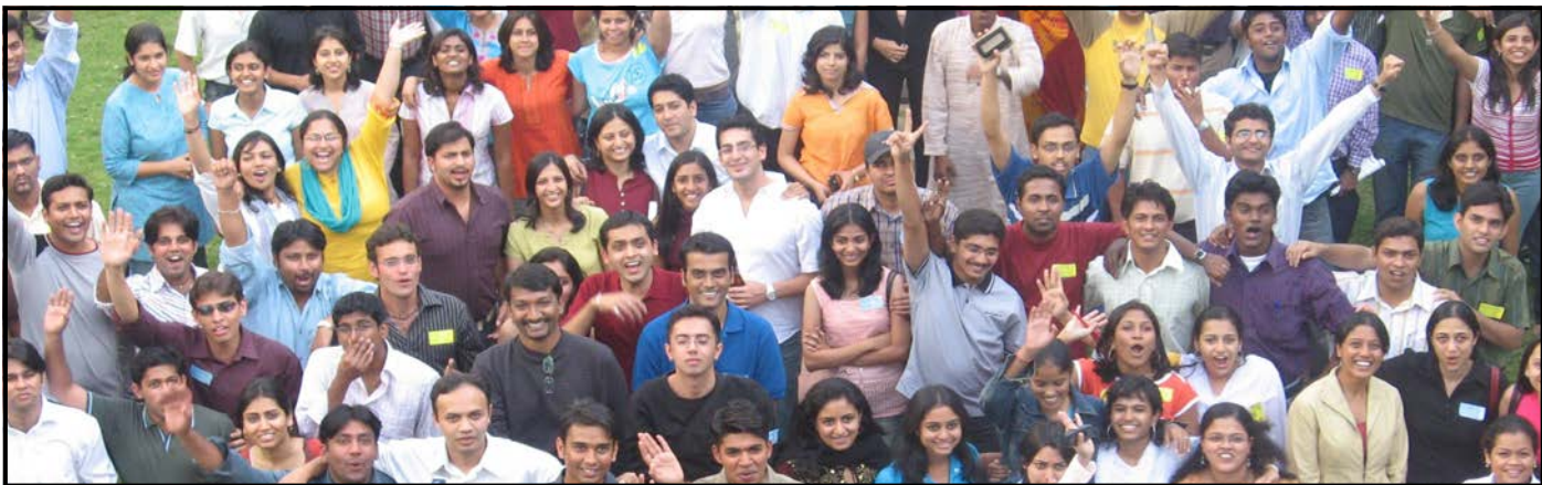
Old times calling

Old times were calling at Xavier Institute of Management & Entrepreneurship (XIME), Bangalore as the alumni from all the previous batches of the institute met for their Annual Alumni Meet on 4 th February, 2006.